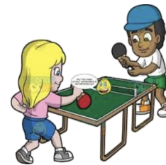
Table Tennis & Short Mat Bowls | Orpington U3A will be held Fridays, 3 – 5 p.m. at Crofton Halls, Orpington, commencing 10th January ( No meeting on 3rd Jan ).

Pickleball | Orpington U3A will be held Tuesdays 12–2pm at Bromley Lawn Tennis & Squash club, Sandford Road, Bromley, starting on 7th January.