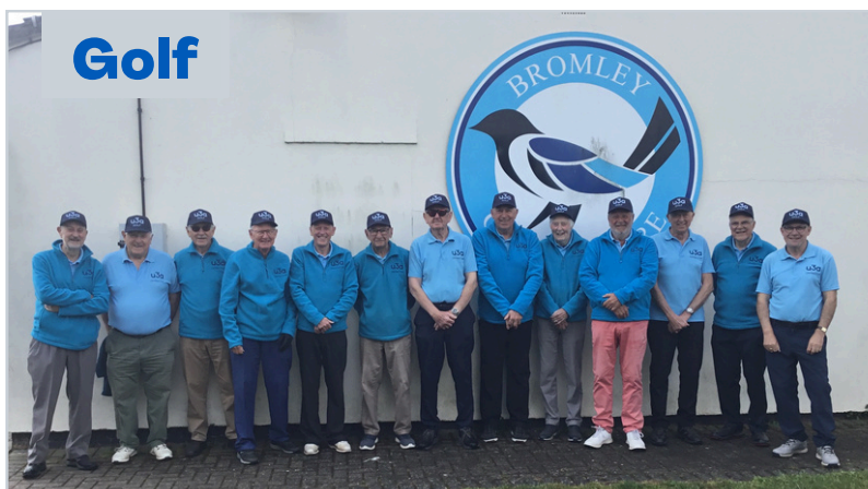
All smiles as u3a Orpington Golf Group members give a 'heads up' to their official golf caps.

'Golf: where optimism meets physics and loses politely'